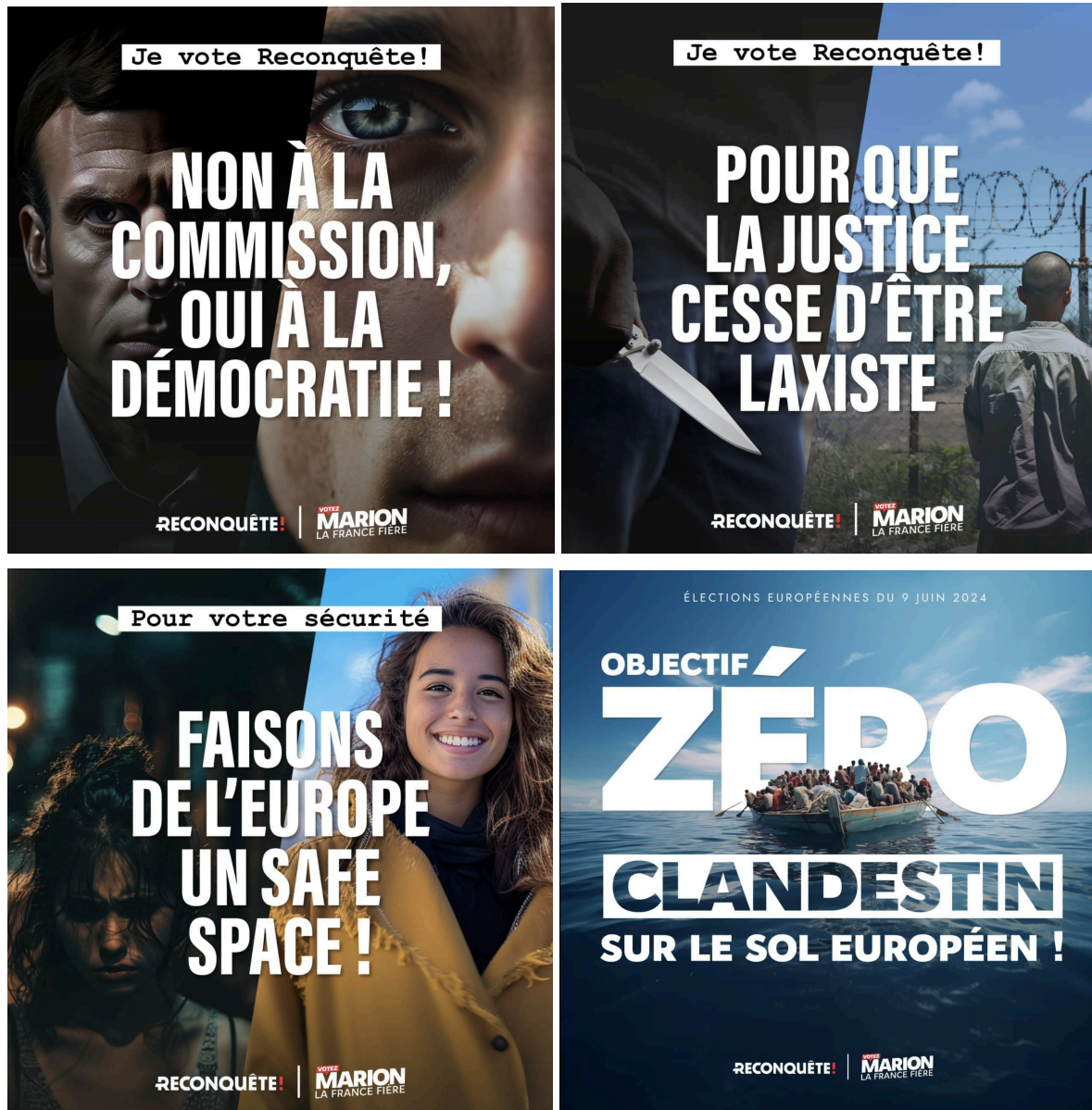
Figure 4: Selection of AI-generated images posted on Reconquête's official channels for the parliamentary elections

Facebook account (3a), as an excerpt of the L'Europe Sans Eux 's website homepage main image (3b).