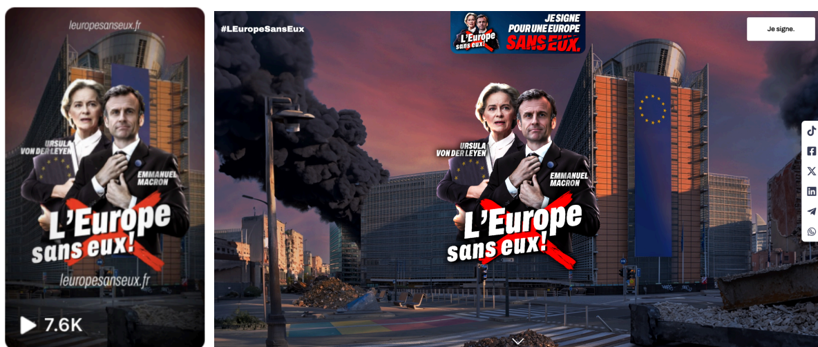
Figures 3a and 3b: AI-generated video thumbnail shared by Rassemblement National's