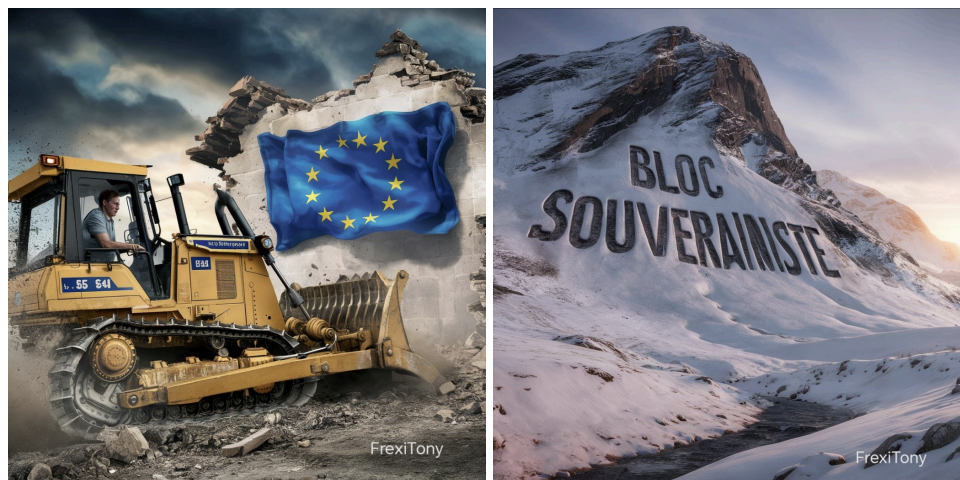
Figure 6: AI-generated images by X user FrexiTony, retweeted by Les Patriotes's official X account

therefore be classified as deceitful. By integrating AI-generated imagery, these parties create visually compelling content that reinforces their political narratives