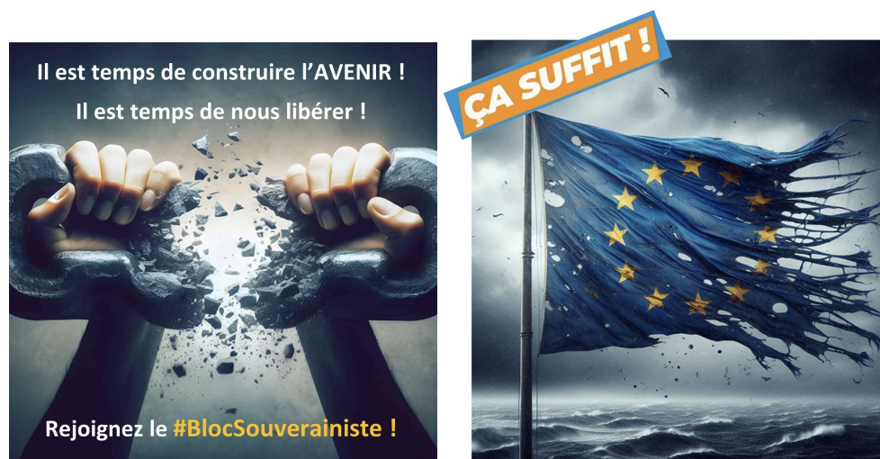
Figure 7: A selection of AI-generated images by unknown owners, retweeted by Les Patriotes's official X account