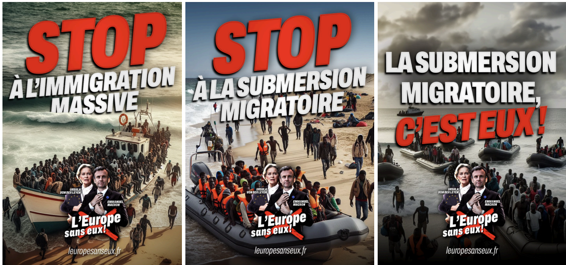
Figures 1a, 1b, and 1c (left to right): A selection of AI-generated images posted by L'Europe Sans Eux's official channels

legislative elections. For both elections, Reconquête systematically shared posts across Facebook, Instagram, and X. As seen in the selection of posts in Figure 4, the